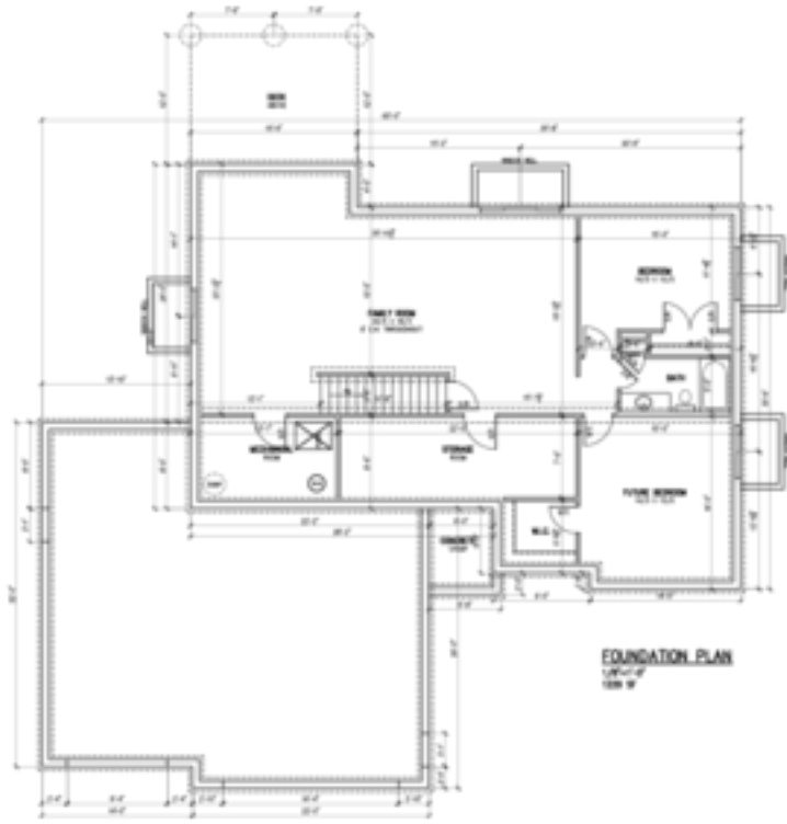
FOUNDATION PLAN 1/4" = 1'-0" 10/10/10